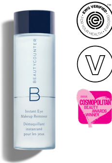
Instant Eye Makeup Remover $25 USD | 30 CAD$

These breakthrough wipes feature a gentle micellar formula designed to trap makeup, dirt, and impurities and whisk them away with no need to rinse. SKU 100000797 30 Wipes (7" x 7.5")