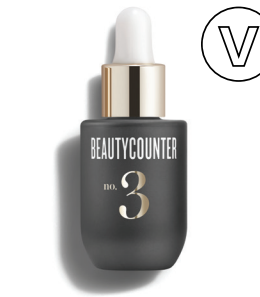
No. 3 Balancing Facial Oil $69 USD | 89 CAD$

Formulated to help hydrate, nourish, and visibly firm skin. Jasmine floral wax provides a subtle floral scent while omega-rich argan oil helps deliver omega acids to the skin. SKU 100000339 20 ml / 0.67 fl oz