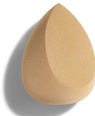
The Better Blender $20 USD | 26 CAD$

With a distinctive fan shape, this brush is uniquely designed for both the quick application of finishing powder and precise application of highlighter or bronzer. SKU 2917