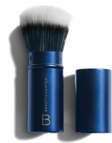
Retractable Foundation Brush $35 USD | 44 CAD$

Designed specifically for liquid foundation, this dome-shaped brush is a must-have for even coverage. SKU 2910