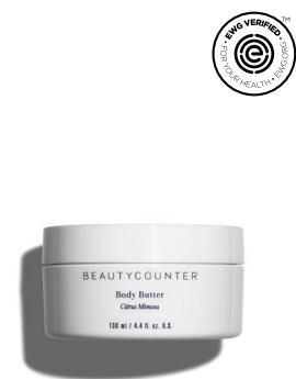
Body Butter in Citrus Mimosa $39 USD | 46 CAD$

Our lightweight body lotion, with a blend of nourishing oils and butters including safflower seed oil and jojoba butter, absorbs quickly into skin. SKU 100000587 236 ml / 8 fl oz