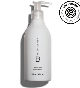
Hand Cream in Citrus Mimosa $30 USD | 38 CAD$

Revive dry hands with this lightweight, moisturizing cream. Including sunflower seed oil, chamomile, and calendula flower extracts, the formula helps nourish and soften skin. SKU 3036 89 ml / 3 fl oz