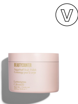
Sugarbuff Body Polish $45 USD | 58 CAD$

New and improved. This quick-absorbing botanical oil blend of grapeseed, argan, rosehip, and passionfruit oils locks in moisture and gives skin a silky sheen. SKU 100000931 100 ml / 3.38 fl oz