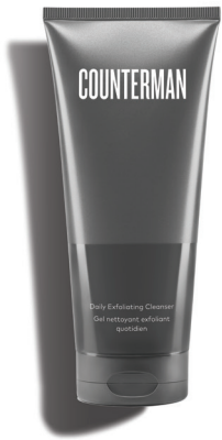
Daily Exfoliating Cleanser $25 USD | 33 CAD$

All CounterMan formulas feature Sequoia Stem Cell Complex, an antioxidant that helps protect skin from everyday stress. (We like to say it’s powered by trees.)