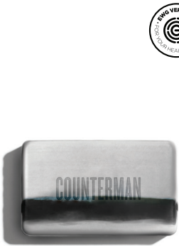
Charcoal Body Bar $19 USD | 25 CAD$

Lightweight and non-greasy, this daily moisturizer absorbs quickly and boosts hydration. SKU 100001028 US / 10001507 CAN 75 ml / 2.5 fl oz