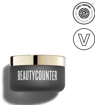
Lotus Glow Cleansing Balm $72 USD | 92 CAD$

Wake up to smoother, more radiant skin with our Overnight Resurfacing Peel. No synthetic fragrances, PEGs, or formaldehyde-based preservatives needed.