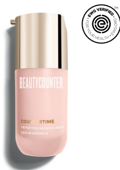
Countertime Tripeptide Radiance Serum $79 USD | 106 CAD$

This transformative, rejuvenating treatment visibly increases skin firmness and elasticity, while reducing the appearance of fine lines and wrinkles. SKU 100000239 30 ml / 1 fl oz