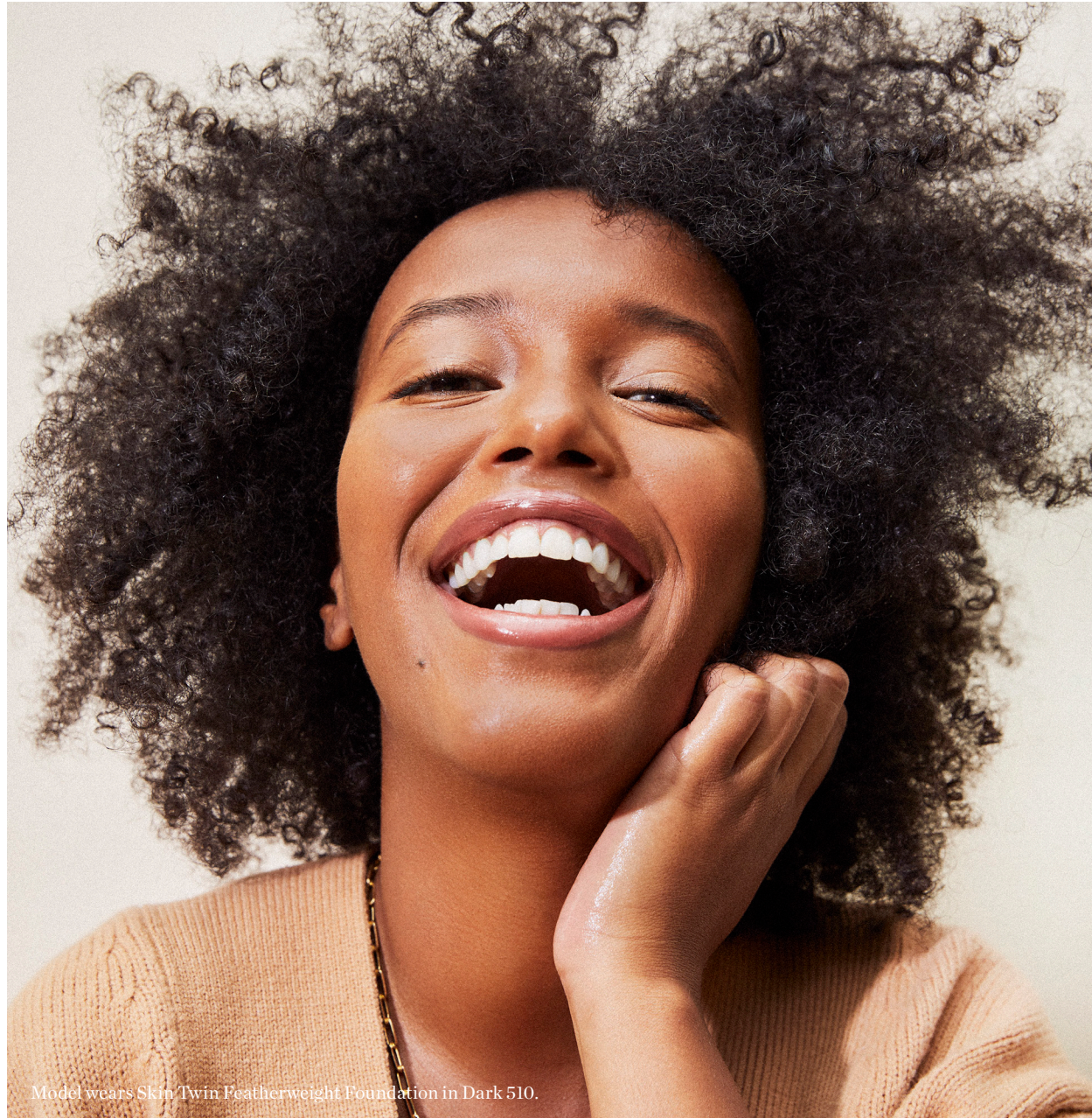
Model wears Skin Twin Featherweight Foundation in Dark 510.

Create the ultimate canvas with these cleaner essentials.