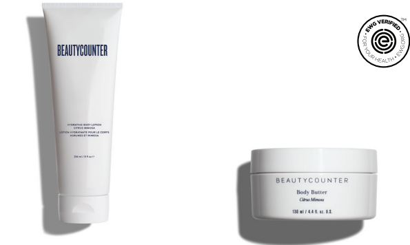
Hydrating Body Lotion in Citrus Mimosa $25 USD | 30 CAD$

Our lightweight body lotion, with a blend of nourishing oils and butters including safflower seed oil and jojoba butter, absorbs quickly into skin. SKU 100000587 236 ml / 8 fl oz