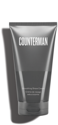
Smoothing Shave Cream $20 USD | 26 CAD$

Exfoliating jojoba beads help remove dead skin cells and unclog pores. SKU 1503 177 ml / 6 fl oz