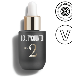
No. 2 Plumping Facial Oil $69 USD | 89 CAD$

Designed to help improve the appearance of skin radiance. Omega-rich marula oil provides intense hydration, while antioxidant vitamin C helps brighten and even skin tone. SKU 100000335 20 ml / 0.67 fl oz