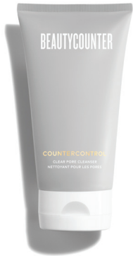
Clear Pore Cleanser $29 USD | 38 CAD$

Our signature SkinBalance Complex utilizes wintergreen and rosebay willow to mattify, clear breakouts, purify pores, and balance skin.