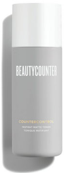
Instant Matte Toner $29 USD | 37 CAD$

This daily exfoliating cleanser effectively removes oil, makeup, and other impurities without harsh surfactants that can strip skin of moisture. SKU 100001024 150 ml / 5 fl oz