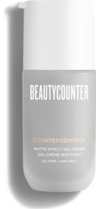
Matte Effect Gel Cream $39 USD | 50 CAD$

A cream-to-gel formulation, this non-greasy hydrator maintains healthy moisture levels while keeping skin matte for up to eight hours.* SKU 100001027 50 ml / 1.7 fl oz