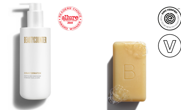
Countermatch Adaptive Body Moisturizer $39 USD | 51 CAD$

Replenish moisture with shea butter and sunflower seed oil—leaving skin feeling soft and smooth. The formula blends easily into skin and absorbs quickly without feeling greasy. SKU 3037 130 ml / 4.4 fl oz