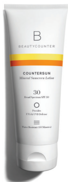
Mineral Sunscreen Lotion SPF 30 $39 USD | 49 CAD$

This continuous-mist sunscreen sprays on white, blends in easily, and dries quickly. SKU 3046 US / 3146 CAN 89 ml / 3 fl oz