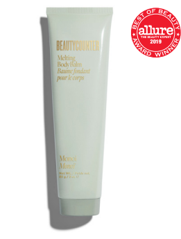
Melting Body Balm $42 USD | 55 CAD$

New and improved. Organic, finely milled sugar makes this body scrub gentle but effective. Sweet almond oil hydrates and softens skin. SKU 100000992 250 g / 8.8 oz