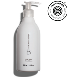
Hand Wash in Citrus Mimosa $26 USD | 33 CAD$

Revive dry hands with this lightweight, moisturizing cream. Including sunflower seed oil, chamomile, and calendula flower extracts, the formula helps nourish and soften skin. SKU 3023 280 ml / 9.5 fl oz