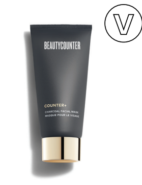
Charcoal Facial Mask $49 USD | 65 CAD$

This balm is a multitasking cleanser and overnight mask featuring a blend of lotus extract, jojoba seed oil, and avocado seed oil. SKU 100000343 75 ml / 2.5 fl oz