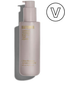
Luminous Hydration Body Oil $65 USD | 85 CAD$

This hydrating serum gives your hands a brightening boost with each use and sanitizes hands with a formula that meets CDC guidelines. SKU 100000991 / US ONLY 50 ml / 1.69 fl oz