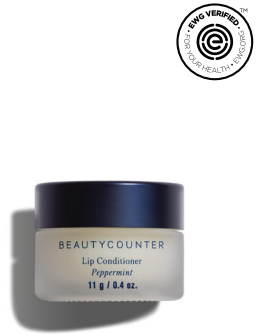
Lip Conditioner $22 USD | 25 CAD$

Our innovative dual-phase formula removes makeup in an instant without irritating the delicate skin around your eyes—just shake to activate. SKU 2555 125 ml / 4.23 fl oz