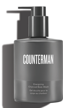
Energizing Charcoal Body Wash $25 USD | 33 CAD$

Featuring charcoal and coconut oil, this invigorating body bar produces a creamy lather to wash away impurities. SKU 1504 142 g / 5 oz