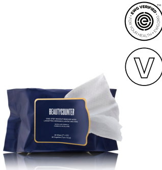
One-Step Makeup Remover Wipes $20 USD | 26 CAD$

Be sure to wash your Better Blender after each use to extend its life and store in a cool, dry place.