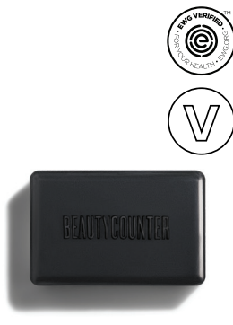
Charcoal Cleansing Bar $26 USD | 33 CAD$

This kaolin clay mask purifies and balances, absorbing excess oil and drawing out impurities. Salicylic and lactic acids aid in gentle exfoliation. SKU 100000851 60 ml / 2 fl oz