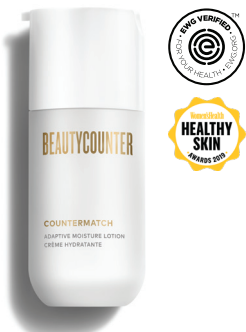
Countermatch Adaptive Moisture Lotion $49 USD | 65 CAD$

This ultra-potent 10% blend of two forms of vitamin C instantly brightens skin and helps reduce the appearance of existing dark spots and help protect against new ones. SKU 100000750 30 ml / 1 fl oz