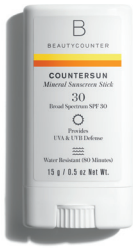
Mineral Sunscreen Stick SPF 30 $21 USD | 27 CAD$

This luxurious sunscreen lotion blends evenly and is water resistant. SKU 3042 / US ONLY 100 ml / 3.4 fl oz