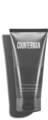
Oil-Free Face Lotion $32 USD | 42 CAD$

This conditioning formula softens facial hair for a close, comfortable shave. SKU 100000299 133 ml / 4.5 fl oz