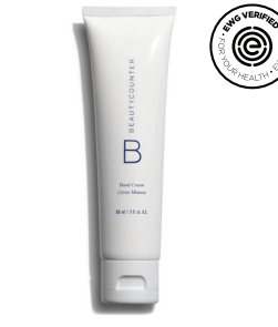
Hand Cream in Citrus Mimosa $18 USD | 21 CAD$

This unique balm transforms into an oil as it melts into skin. Argan and avocado oils help nourish, hydrate, and soften, and this Monoi-scented multitasker got a sustainable upgrade thanks to PCR packaging.* SKU 100001002 85 g / 3 oz