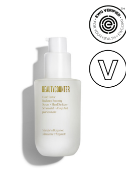
Hand Savior Radiance Boosting Serum + Hand Sanitizer $32 USD

This hydrating serum gives your hands a brightening boost with each use and sanitizes hands with a formula that meets CDC guidelines. SKU 100000991 / US ONLY 50 ml / 1.69 fl oz