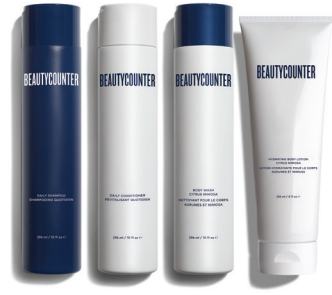
Body Collection $96 USD | 121 CAD$

Formulated with a soothing blend of organic shea butter, sunflower seed oil, and jojoba seed oil, this balm helps relieve dry skin (including mom's). SKU 100000538 85 g / 3 oz