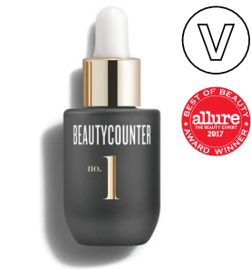
No. 1 Brightening Facial Oil $69 USD | 89 CAD$

Binchotan charcoal powder helps detoxify skin and absorb impurities (without dryness). This bar gives you a smoother, brighter complexion. SKU 100000439, 3027 85 g / 3.0 oz