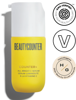
Counter+ All Bright C Serum $82 USD | 110 CAD$

Featuring a proprietary multi-acid complex, this leave-on AHA/beta-hydroxy acid peel improves skin texture and boosts clarity without irritation or over-drying. SKU 100000342 30 ml / 1 fl oz