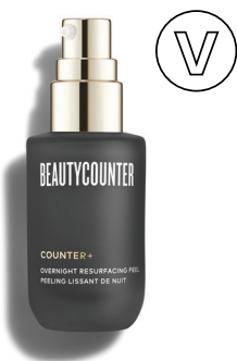
Counter+ Overnight Resurfacing Peel $65 USD | 85 CAD$

This transformative, rejuvenating treatment visibly increases skin firmness and elasticity, while reducing the appearance of fine lines and wrinkles. SKU 100000239 30 ml / 1 fl oz