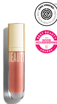
Beyond Gloss $29 USD | 36 CAD$

This benefit-packed tinted moisturizer delivers lightweight hydration, a hint of sheer coverage, SPF 20, and a luminous dewy glow. See page 7 for a list of shades. 40 ml / 1.35 fl oz