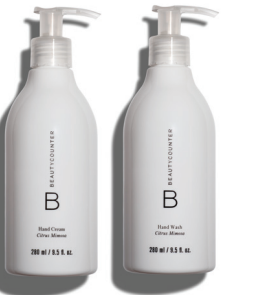
Citrus Mimosa Hand Wash & Hand Cream Set $49 USD | 60 CAD$

Including organic aloe, chamomile, and green tea extracts, the formula helps keep hands soft without leaving any residue. SKU 3022 280 ml / 9.5 fl oz