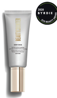
Dew Skin Tinted Moisturizer $45 USD | 56 CAD$

This lightweight lotion provides essential nutrition and oxygenation to keep skin soft and glowing for up to 24 hours of hydration.* SKU 100000458 / 100001025 50 ml / 1.7 fl oz