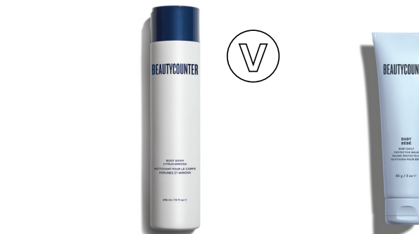
Body Wash in Citrus Mimosa $25 USD | 30 CAD$

With shea butter, marula, and mongongo oils, this refreshing scented body bar delivers a non-drying cleanse. SKU 3029 141 g / 5 oz