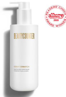
Countermatch Adaptive Body Moisturizer $39 USD | 51 CAD$

Replenish moisture with shea butter and sunflower seed oil—leaving skin feeling soft and smooth. The formula blends easily into skin and absorbs quickly without feeling greasy. SKU 3037 130 ml / 4.4 fl oz