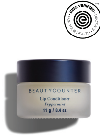
Lip Conditioner $22 USD | 25 CAD$

Our innovative dual-phase formula removes makeup in an instant without irritating the delicate skin around your eyes—just shake to activate. SKU 2555 125 ml / 4.23 fl oz