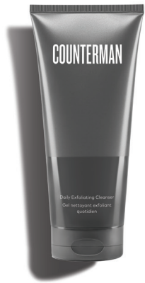
Daily Exfoliating Cleanser $25 USD | 33 CAD$

All Counterman formulas feature Sequoia Stem Cell Complex, an antioxidant that helps protect skin from everyday stress. (We like to say it’s powered by trees.)