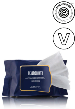
One-Step Makeup Remover Wipes $20 USD | 26 CAD$

Be sure to wash your Better Blender after each use to extend its life and store in a cool, dry place.