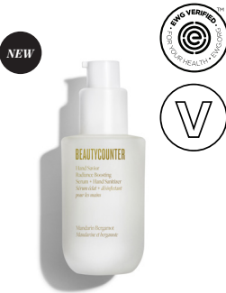
Hand Savior Radiance Boosting Serum + Hand Sanitizer $32 USD

This hydrating serum gives your hands a brightening boost with each use and sanitizes hands with a formula that meets CDC guidelines. SKU 100000991 / US ONLY 50 ml / 1.69 fl oz