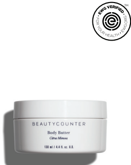
Body Butter in Citrus Mimosa $39 USD | 46 CAD$

Our lightweight body lotion, with a blend of nourishing oils and butters including safflower seed oil and jojoba butter, absorbs quickly into skin. SKU 100000587 236 ml / 8 fl oz