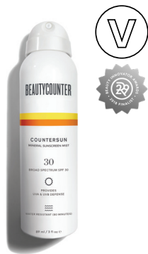
Mineral Sunscreen Mist SPF 30—3 oz. $20 USD | 26 CAD$

This continuous-mist sunscreen sprays on white, blends in easily, and dries quickly. SKU 3045 US / 3145 CAN 177 ml / 6 fl oz