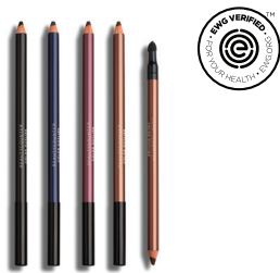
Color Outline Eye Pencil $24 USD | 29 CAD$

Dark (SKU 2507), Medium (SKU 2506), Light (SKU 2505)