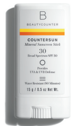
Mineral Sunscreen Stick SPF 30 $21 USD | 27 CAD$

This luxurious sunscreen lotion blends evenly and is water resistant. SKU 3042 / US ONLY 100 ml / 3.4 fl oz