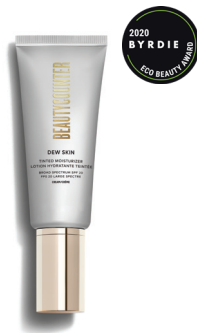
Dew Skin Tinted Moisturizer $45 USD | 56 CAD$

This lightweight lotion provides essential nutrition and oxygenation to keep skin soft and glowing for up to 24 hours of hydration.* SKU 100000458 50 ml / 1.7 fl oz