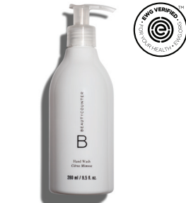
Hand Wash in Citrus Mimosa $26 USD | 33 CAD$

Revive dry hands with this lightweight, moisturizing cream. Including sunflower seed oil, chamomile, and calendula flower extracts, the formula helps nourish and soften skin. SKU 3023 280 ml / 9.5 fl oz