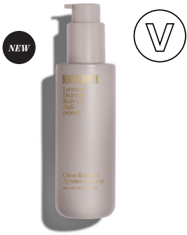
Luminous Hydration Body Oil $65 USD | 85 CAD$

This hydrating serum gives your hands a brightening boost with each use and sanitizes hands with a formula that meets CDC guidelines. SKU 100000991 / US ONLY 50 ml / 1.69 fl oz