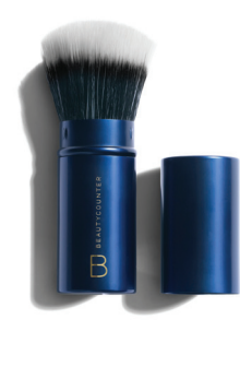
Retractable Foundation Brush $35 USD | 44 CAD$

Designed specifically for liquid foundation, this dome-shaped brush is a must-have for even coverage. SKU 2910