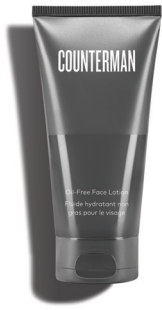
Oil-Free Face Lotion $32 USD | 42 CAD$

This conditioning formula softens facial hair for a close, comfortable shave. SKU 100000299 133 ml / 4.5 fl oz