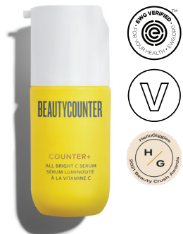
Counter+ All Bright C Serum $82 USD | 110 CAD$

Featuring a proprietary multi-acid complex, this leave-on AHA/BHA peel improves skin texture and boosts clarity without irritation or over-drying. SKU 100000342 30 ml / 1 fl oz