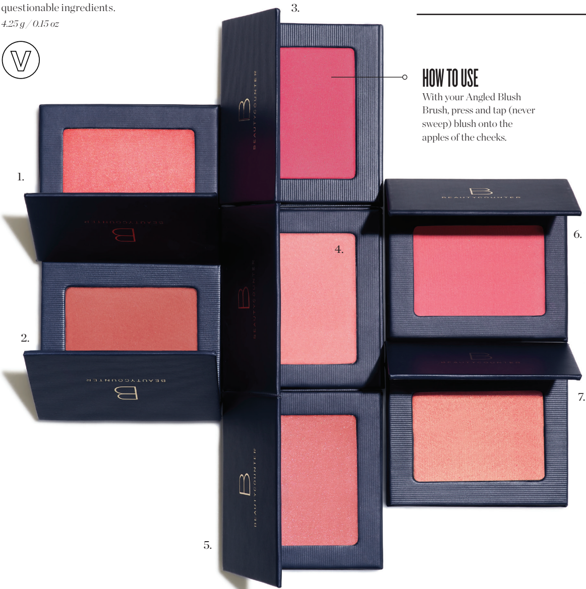
1. Passionfruit (SKU 2926), 2. Date (SKU 2921), 3. Raspberry (SKU 2925), 4. Melon (SKU 2920), 5. Sorbet (SKU 2922), 6. Guava (SKU 2924), 7. Nectar (SKU 2923)

Over 1,800 questionable ingredients are never used in our formulations—we call this The Never List™. Download a pocket-sized version to consult whenever and wherever you’re shopping for beauty products.