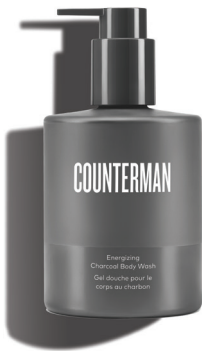
Energizing Charcoal Body Wash $25 USD | 33 CAD$

Featuring charcoal and coconut oil, this invigorating body bar produces a creamy lather to wash away impurities. SKU 1504 142 g / 5 oz