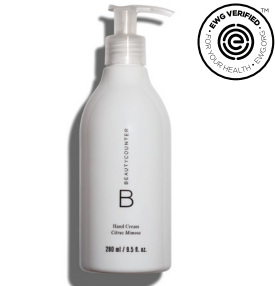
Hand Cream in Citrus Mimosa $30 USD | 38 CAD$

Revive dry hands with this lightweight, moisturizing cream. Including sunflower seed oil, chamomile, and calendula flower extracts, the formula helps nourish and soften skin. SKU 3036 89 ml / 3 fl oz