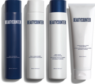
Body Collection $96 USD | 121 CAD$

Formulated with a soothing blend of organic shea butter, sunflower seed oil, and jojoba seed oil, this balm helps relieve dry skin (including mom's). SKU 100000538 85 g / 3 oz