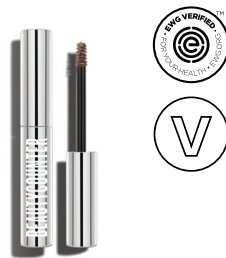
Brilliant Brow Gel $24 USD | 30 CAD$

Our mascara is pigmented with naturally occurring iron oxides—and is never formulated with potentially harmful pigments like carbon black.