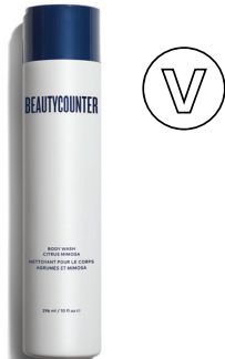
Body Wash in Citrus Mimosa $25 USD | 30 CAD$

With shea butter, marula, and mongongo oils, this refreshing scented body bar delivers a non-drying cleanse. SKU 3029 141 g / 5 oz