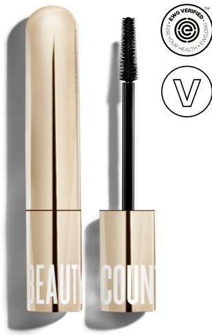
Think Big All-in-One Mascara $26 USD | 35 CAD$

Luster (SKU 100001115), Aura (SKU 100001116), Gleam (SKU 100001117), Flash (SKU 100001118), Sepia (SKU 100001119), Ember (SKU 100001120), Twinkle (SKU 100001121), Haze (SKU 100001122), Dusk (SKU 100001123), Prism (SKU 100001124)