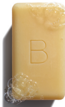
Citrus Mimosa Body Bar $22 USD | 25 CAD$

Rich yet rapidly absorbing, it softens without a trace of stickiness and helps achieve 24 hours of hydration.** SKU 100000450 242 ml / 8.25 fl oz