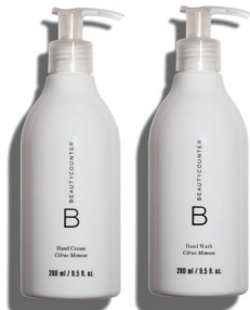
Citrus Mimosa Hand Wash & Hand Cream Set $49 USD | 60 CAD$

Including organic aloe, chamomile, and green tea extracts, the formula helps keep hands soft without leaving any residue. SKU 3022 280 ml / 9.5 fl oz