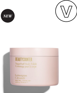
Sugarbuff Body Polish $45 USD | 58 CAD$

New and improved. This quick-absorbing botanical oil blend of grapeseed, argan, rosehip, and passionfruit oils locks in moisture and gives skin a silky sheen. SKU 100000931 100 ml / 3.38 fl oz