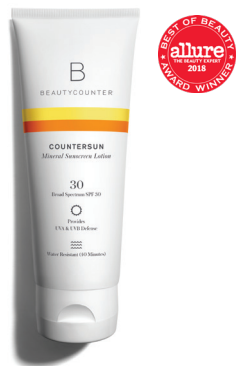
Mineral Sunscreen Lotion SPF 30 $39 USD | 49 CAD$

This continuous-mist sunscreen sprays on white, blends in easily, and dries quickly. SKU 3046 US / 3146 CAN 89 ml / 3 fl oz