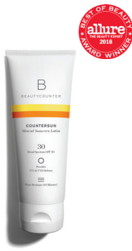
Mineral Sunscreen Lotion SPF 30—3.4 oz. $25 USD

This luxurious sunscreen lotion blends evenly and is water resistant. SKU 3041 US / 3141 CAN 198 ml / 6.7 fl oz