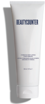
Hydrating Body Lotion in Citrus Mimosa $25 USD | 30 CAD$

Our lightweight body lotion, with a blend of nourishing oils and butters including safflower seed oil and jojoba butter, absorbs quickly into skin. SKU 100000587 236 ml / 8 fl oz