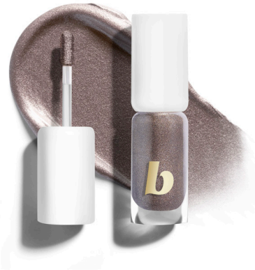
Lid Glow Cream Shadow $24 USD | 30 CAD$

Achieve glowy, effortless color with lid-loving ingredients, featuring cucumber and chamomile extract to help soothe and hydrate delicate eyelid skin. The glass bottle is recyclable, and the cap is made from 100% PCR plastic.