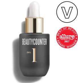
No. 1 Brightening Facial Oil $69 USD | 89 CAD$

Binchotan charcoal powder helps detoxify skin and absorb impurities (without dryness). This bar gives you a smoother, brighter complexion. SKU 100000439, 3027 85 g / 3.0 oz