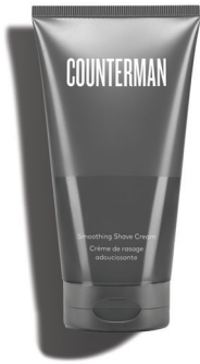
Smoothing Shave Cream $20 USD | 26 CAD$

Exfoliating jojoba beads help remove dead skin cells and unclog pores. SKU 1503 177 ml / 6 fl oz