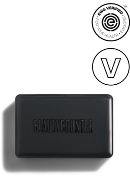
Charcoal Cleansing Bar $26 USD | 33 CAD$

This kaolin clay mask purifies and balances, absorbing excess oil and drawing out impurities. Salicylic and lactic acids aid in gentle exfoliation. SKU 100000851 60 ml / 2 fl oz