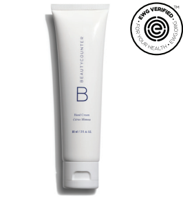
Hand Cream in Citrus Mimosa $18 USD | 21 CAD$

This unique balm transforms into an oil as it melts into skin. Argan and avocado oils help nourish, hydrate, and soften, and this Monoi-scented multitasker got a sustainable upgrade thanks to PCR packaging.* SKU 100001002 85 g / 3 oz