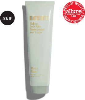
Melting Body Balm $42 USD | 55 CAD$

New and improved. Organic, finely milled sugar makes this body scrub gentle but effective. Sweet almond oil hydrates and softens skin. SKU 100000992 250 g / 8.8 oz