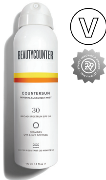
Mineral Sunscreen Mist SPF 30 $36 USD | 46 CAD$

Instead of using potentially irritating chemical filters, we use non-nano zinc oxide—a safer mineral blocker that sits on the surface of skin and bounces sun's rays away.