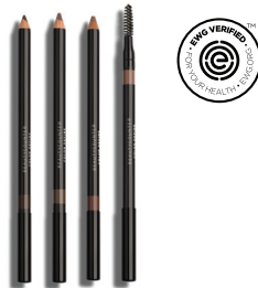
Color Define Brow Pencil $24 USD | 29 CAD$

Invisible (100000145), Light (SKU 100000146), Medium (SKU 100000147), Dark (SKU 100000148), Soft Black (SKU 100000149)