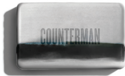
Charcoal Body Bar $19 USD | 25 CAD$

Lightweight and non-greasy, this daily moisturizer absorbs quickly and boosts hydration. SKU 1507 75 ml / 2.5 fl oz